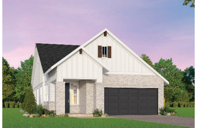
TEXAS HILL COUNTRY