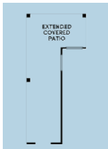
Extended Covered Patio