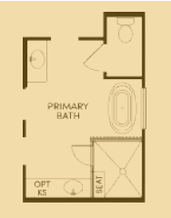
Primary Bath w/ freestanding tub