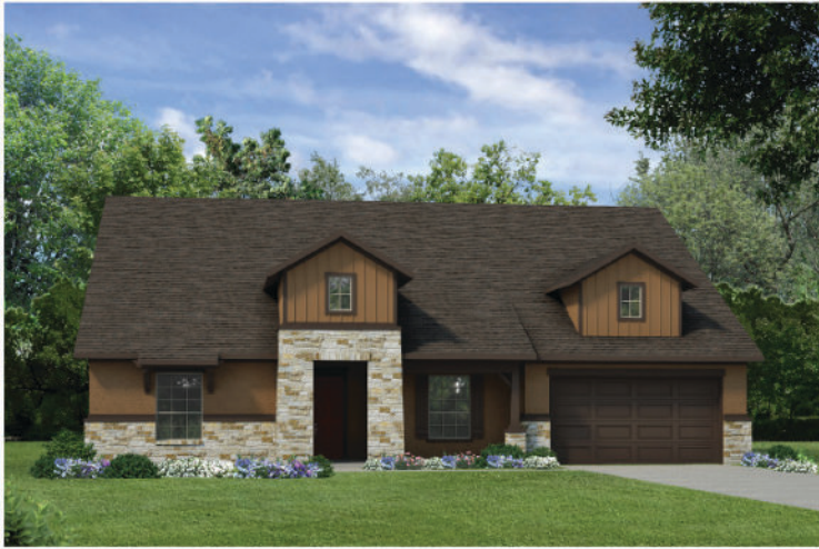
Texas Hill Country