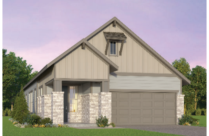
TEXAS HILL COUNTRY