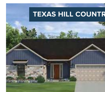
TEXAS HILL COUNTRY